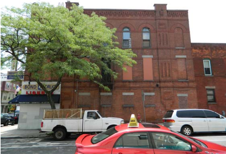
371 Central Avenue