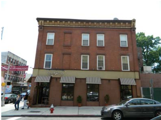
513 Central Avenue