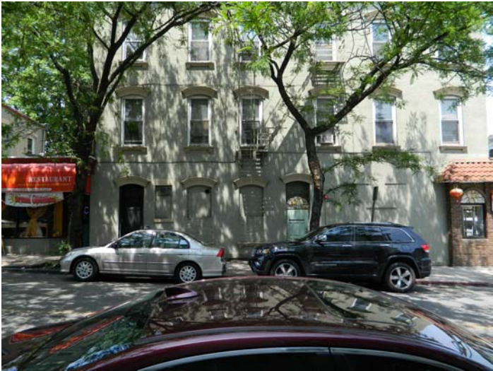
287 Central Avenue