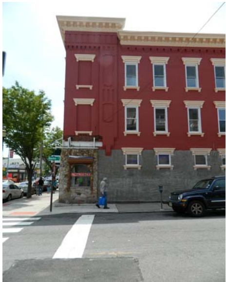
437 Central Avenue