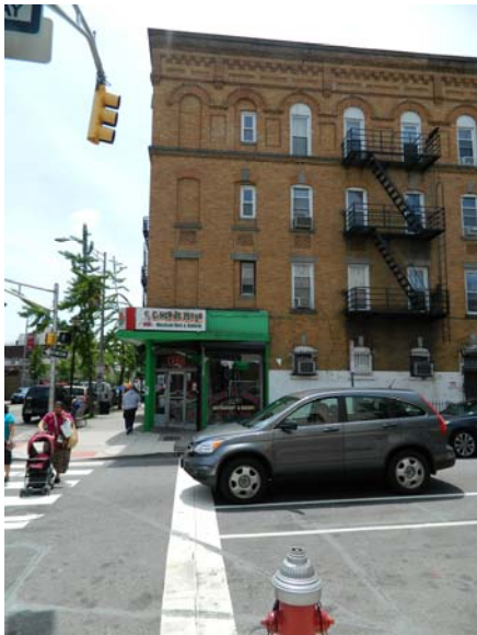
403 Central Avenue