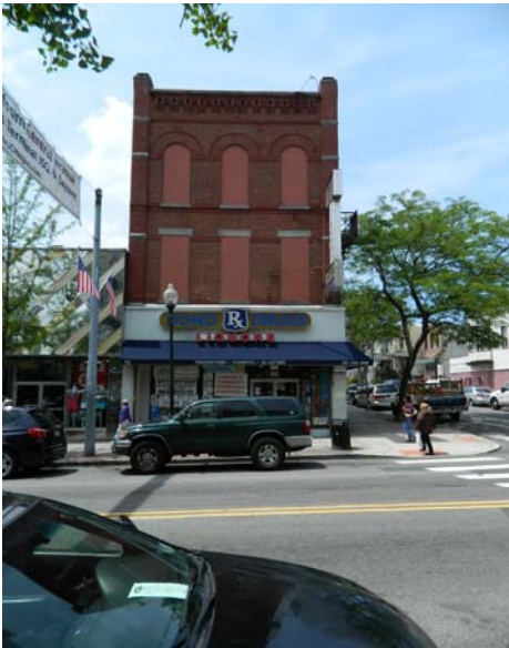
371 Central Avenue