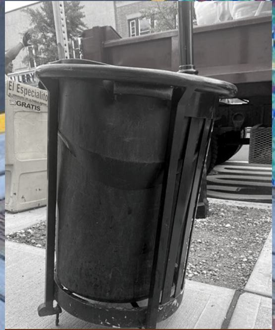
OLD LITTER CANS