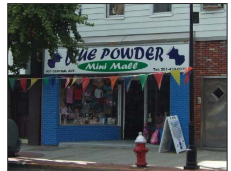
Blue Powder 451 Central Ave. (201) 459-0039