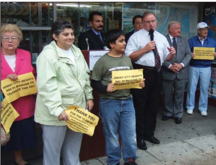
Mayor Jerramiah Healy speaks to Heights residents and community leaders about the importance of bus service on Central Avenue at an August 22 press conference.

Coach USA officials say that they had to cancel the 231 as well as routes 3 and 5 because of changes in ridership caused by new development and the success of the Hudson-Bergen Light Rail. The 231 service was cancelled once before in early 2006, only to be returned on a limited basis after public outcry. During the brief period without