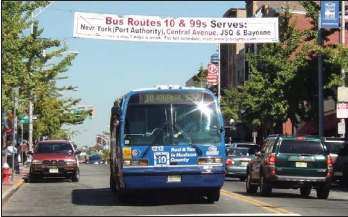
A Coach USA #10 bus coming from New York makes stops on Central Avenue before heading to Journal Square and Bayonne.

A recent round of economic feasibility studies has led Coach USA Red and Tan in Hudson County to move routes 10 and 99s to Central Avenue, thus maintaining service on this crucial business corridor following the cancellation of the company's 231 route.