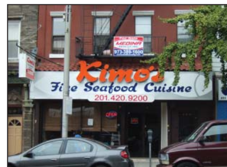
Kimo's Fine Seafood Cuisine 449 Central Ave. (201) 420-9200