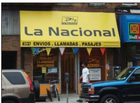
La Nacional 391 Central Ave. (201) 420-1496