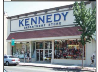
Before and after: the facade of Kennedy Department Store

Although major renovations involve a much more intensive investment of money and time than facade improvements, they too can pay off for building owners seeking to attract new tenants or even buyers. In the short term, local business owners hope that the renovations of their buildings will bring more shoppers to the area. But their investments will also pay off by attracting new businesses and residents that will follow their lead and invest in Central Avenue for the long haul.