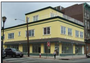
An overhaul of 443-445 Central Avenue will allow the building to accommodate three businesses as well as residents.

Another major construction project has transformed the former Summit Archery building on 443-445 Central Ave into a modern structure featuring three ground-floor retail spaces and residential condos on the second floor. The owner has invested $120,000 on the exterior improvements alone and has added several novel features including in-building garage bays and a rooftop deck.