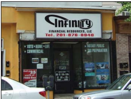
Infinity Financial Resources 279 Central Ave. (201) 876-8940