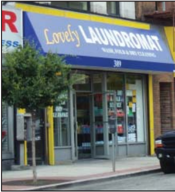
The facade of Lovely Laundromat features a bright new awning.

are shoring up aging buildings and updating facades to attract new customers. Active construction is taking place in many storefronts that may appear at first glance to be vacant. In fact, the vacancy rate on the Avenue is only about 5%, which compares favorably with the national main street average of 10%. If property owners can maintain affordable rents, the combination of high demand and the current wave of renovations could push the Avenue's vacancy rate even lower.