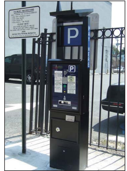
The multi-space meter's location has confused many patrons of Central Avenue.