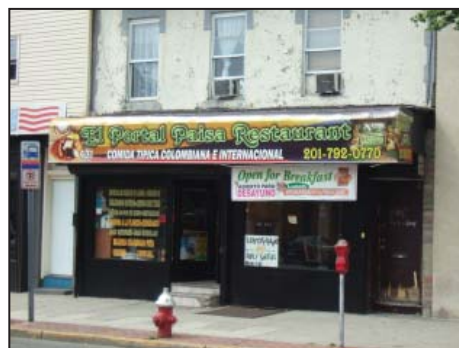
El Portal Paisa 431 Central Ave. (201) 792-0770