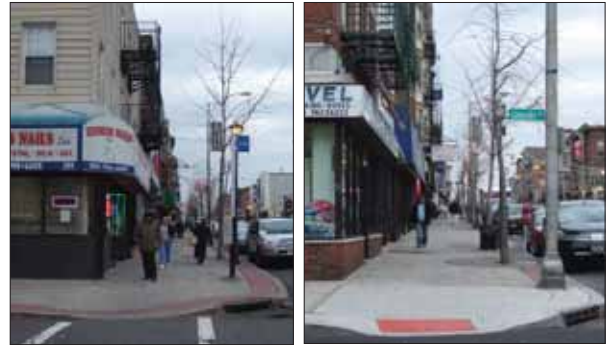
The corners of Central & Griffith and Central & Lincoln, showing the traditional curb design and the new ADA-compliant design.