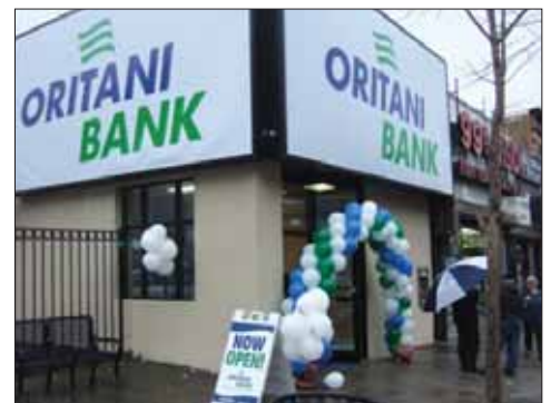
Oritani Bank's new branch at 348 Central Ave.

During the grand opening, Oritani Bank welcomed the local community to come and enjoy complimentary music, entertainment, and refreshments as well as a prize drawing and special promotions on bank products.