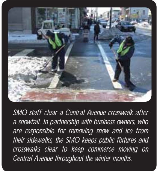
SMO staff clear a Central Avenue crosswalk after a snowfall. In partnership with business owners, who are responsible for removing snow and ice from their sidewalks, the SMO keeps public fixtures and crosswalks clear to keep commerce moving on Central Avenue throughout the winter months.

The Central Avenue Street Maintenance Operation (SMO) staff can be seen daily on Central Avenue, removing trash and serving as ambassadors for shoppers and business owners alike.